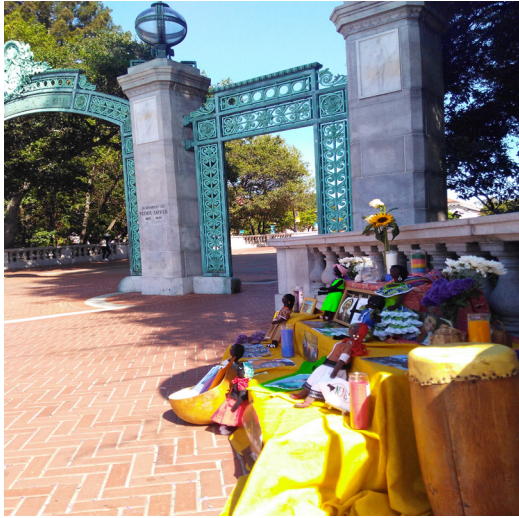
Figure 4. Altar in honor for Marielle Franco, Brazilian feminist, sponsored by the Center for Latin American Studies in University of California, Berkeley, 2018.