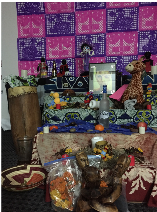
Figure 3. Altar in honor of Sara Baartman, 2017. African American Studies, and Gender and Women's Studies Department, University of California, Berkeley.